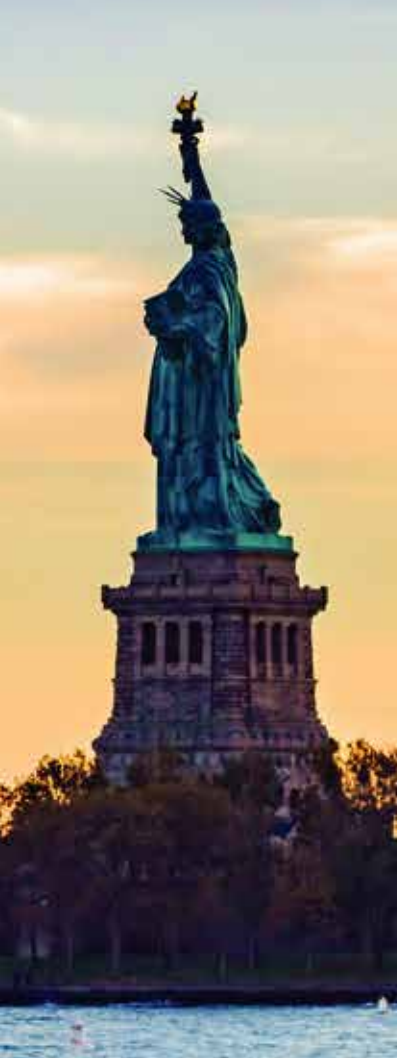
United States of America